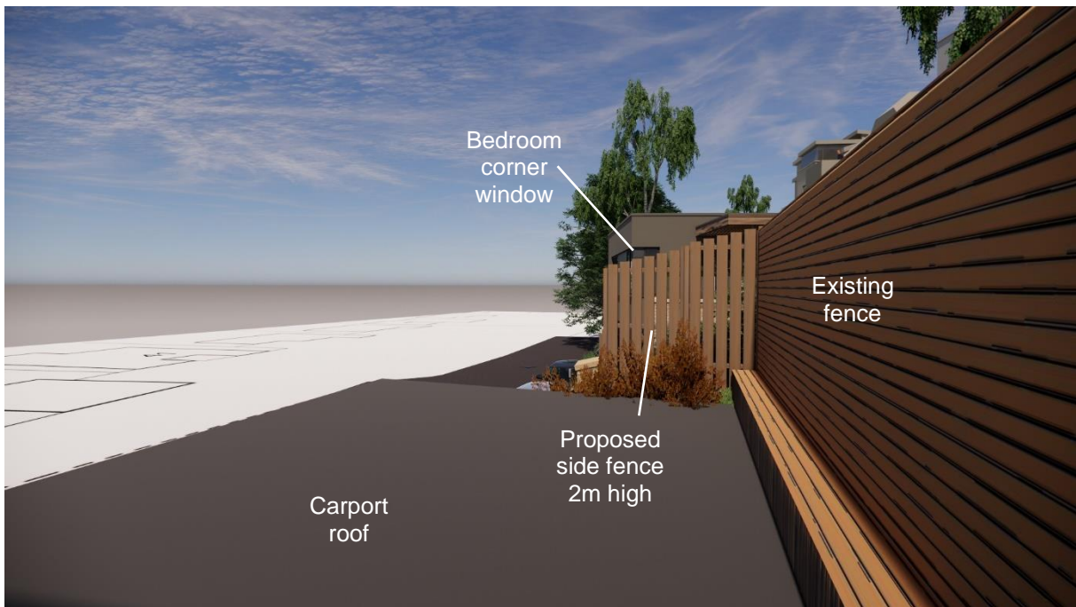
01 View from bathroom window of No. 16