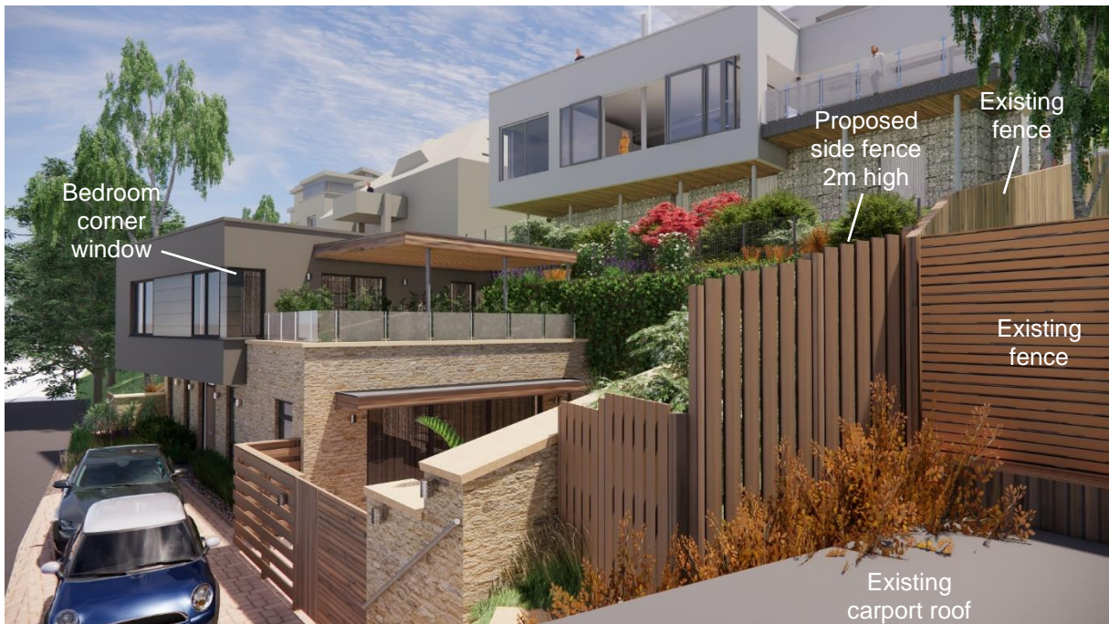
03 Detail of side boundary fence,